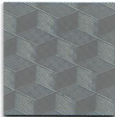
7024 - Grey