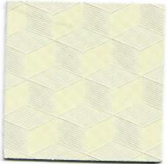
1622 - Beige