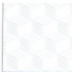
9002 - White