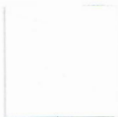
9909 - White